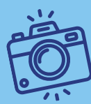
Photo Waiver: The Nippersink Public Library District reserves the right to photograph program participants and patrons. Photos are for Library use only and may be used for promotions in print, digital, and social media. Attending Library events provides your expressed consent to take and utilize photographs taken of you and/or your family. If you would not like your picture taken please let staff know before the start of the program.